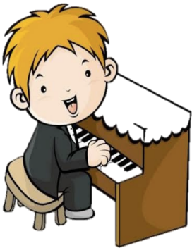
Play the piano