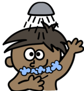
Have a shower